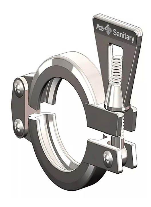
Shown with Standard Wing Nut